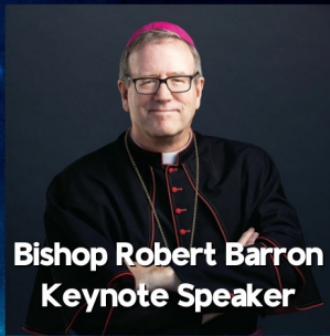
Bishop Robert Barron Keynote Speaker

For Post-Confirmation High School Students