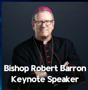
Bishop Robert Barron Keynote Speaker

For Post-Confirmation High School Students